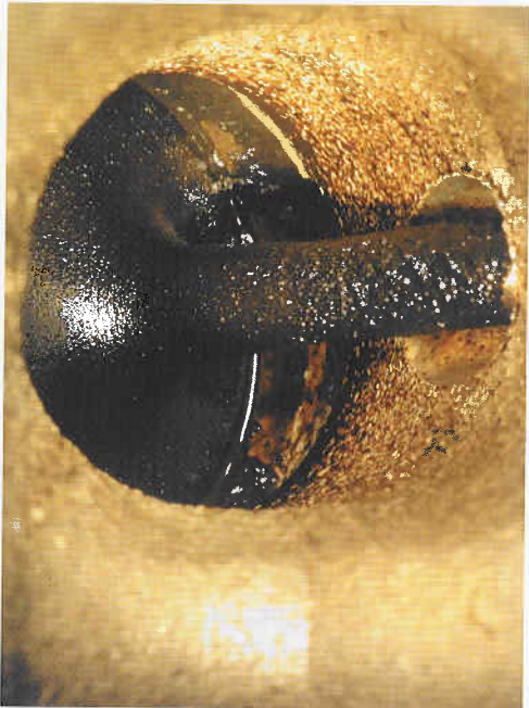
After cleaning: Your engine again achieves peak performance with greater fuel efficiency.

When you bring your BMW in for this optional service 1 , professional BMW service technicians will thoroughly clean your engine's fuel system with our exclusive, BMW-approved Fuel Injector and Induction Cleaning System with TECHRON® technology. This service quickly helps eliminate harmful carbon deposit buildup and helps restore your BMW's original fuel economy and dynamic power and acceleration.