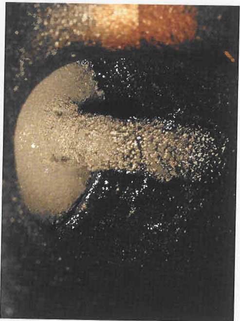
Before cleaning: Over time, even nationally known brands can leave excessive carbon deposits in the intake manifold and, especially, on the intake valves.

If you experience these symptoms, it's time to give your engine a BMW Fuel Injector and Induction System Cleaning service.